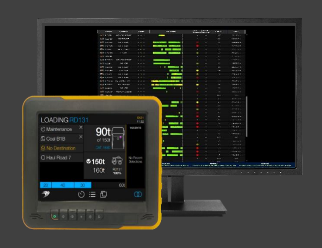
iVolve Display & Maintenance Dashboard

iVolve Mine4D Maintenance provides real-time equipment health data feeds. This data is displayed graphically with the iControl Maintenance dashboard at fleet and individual asset levels, and full data history is available for both ad-hoc and scheduled reporting.